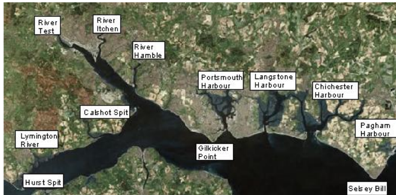
North Solent SMP Study Area

Downloadable documents will usually be in PDF format, and as such you will need Adobe Acrobat to view them, which can be freely obtained by visiting http://www.newforest.gov.uk/