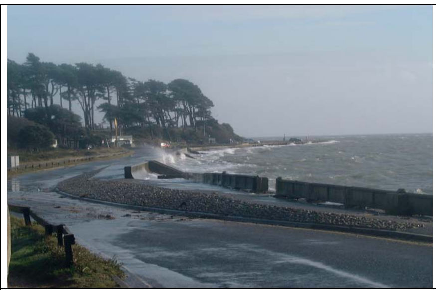
Wave overtopping at Lepe, January 2001