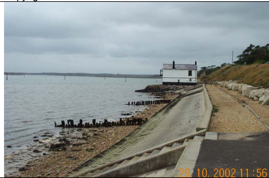
The Watch House near Lepe, October 2002