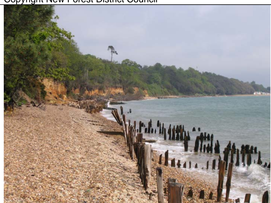
Cadland, East of Lepe, May 2005